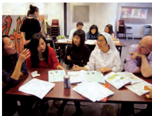
A forum for sharing ideas on how to implement the Reading Workshops