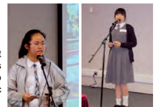
An inter-school event which provides students with opportunities to learn and practise public speaking