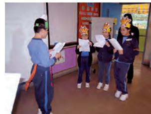
Cross-phase speaking-focused activities for primary and secondary students