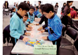
An inter-school writing competition in which primary students go through the different processes of writing and apply their writing skills