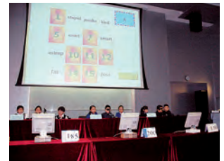
An inter-school competition which provides an opportunity for primary students to apply their knowledge in vocabulary building skills and reading skills