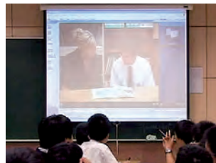
A cross-phase buddy reading project, with training programme for secondary students