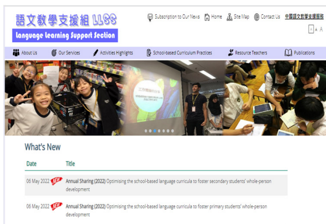
LLSS homepage 本組網頁