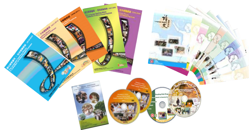
LLSS Publications 本組刊物