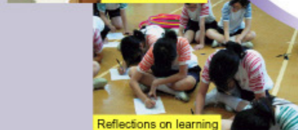
Reflections on learning