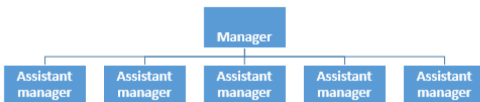
Fig. 9.2 Example of a flat management structure