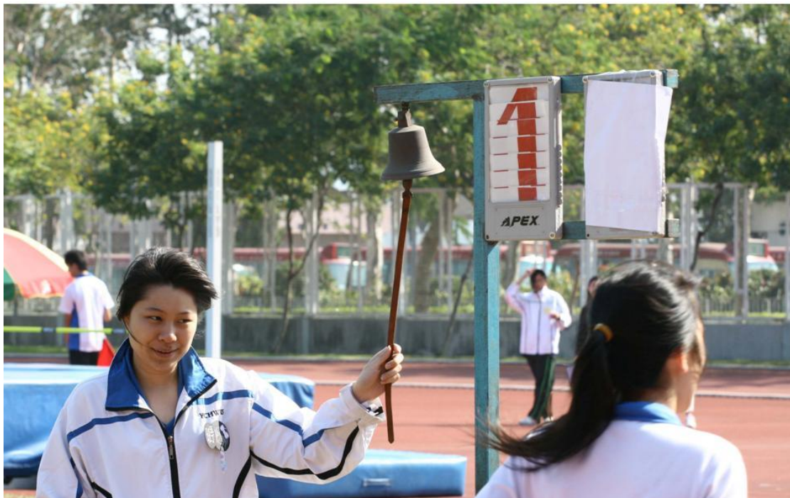
Fig 9.4 A snapshot of an event organised by students